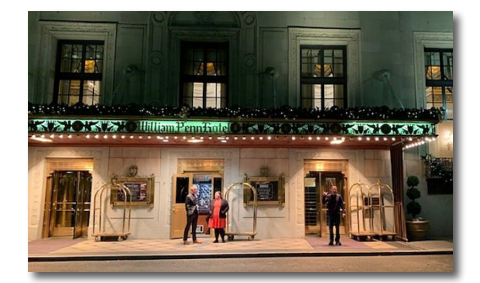
2022 July 24-27