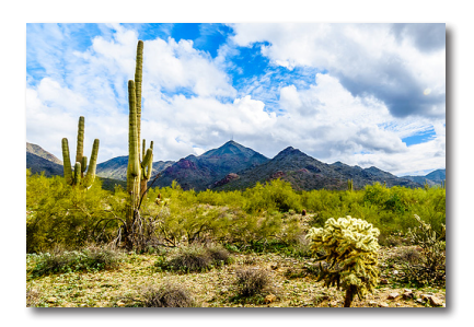
2021 July 19–22

Details as they are available at: www.sofe.org