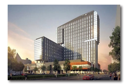
2023 July 16-19