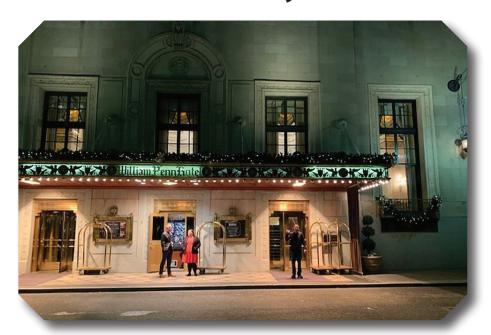
2022 July 24–27

Details as they are available at: www.sofe.org