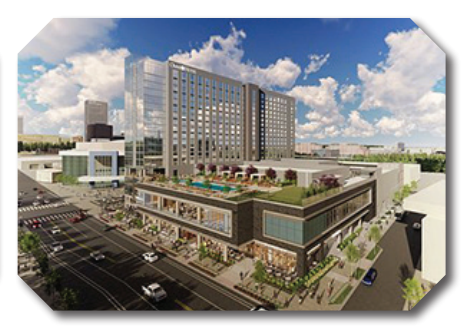
2024 July 28-August 1

Oklahoma City, OK Omni Oklahoma City Hotel