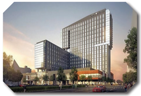
2023 July 16-19