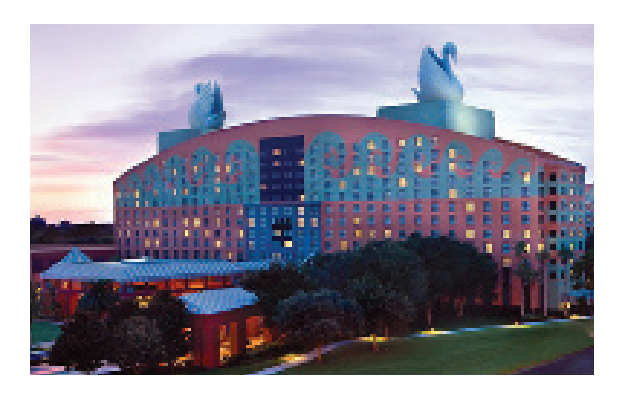
2020 July 19 – 22 Orlando, Florida Walt Disney World Swan Hotel