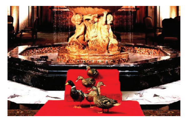
2019 July 21–24 Memphis, Tennessee The Peabody Memphis