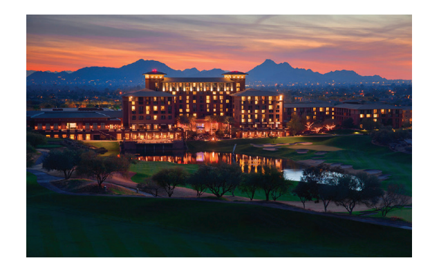
2021 July 18–21 Scottsdale, AZ Westin Kierland