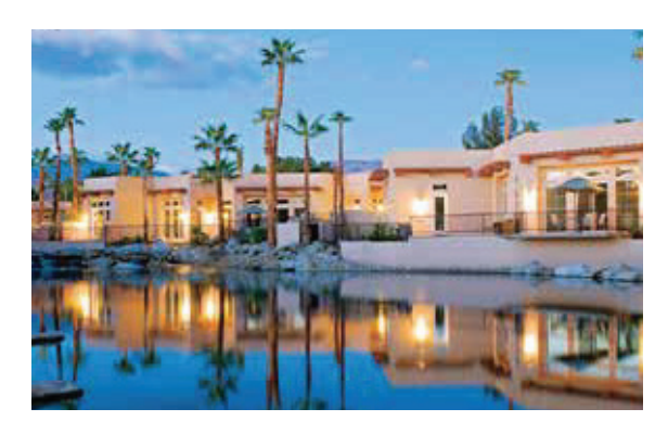
2018 July 15 – 18 Indian Wells, California Hyatt Regency Indian Wells

Details as they are available at: www.sofe.org