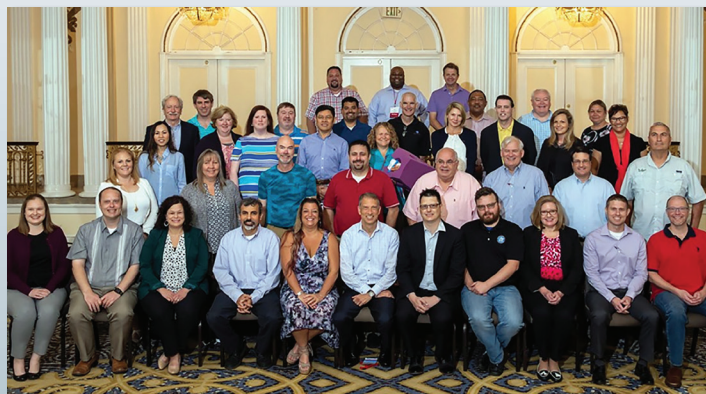
Current Board Governors

Online voting for vacancies in the 2020-2021 Board of Governors will be live on the SOFE website on JUNE 5 . Voting closes on JUNE 29 . Your vote counts! Refer to the SOFE Members Only section of the website for more information on the candidates and online voting.