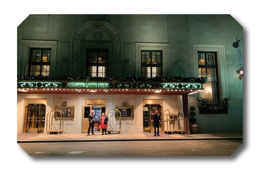
2022 July 24–27 Pittsburgh, PA Omni William Penn