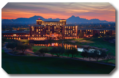
2021 July 18–21 Scottsdale, AZ Westin Kierland