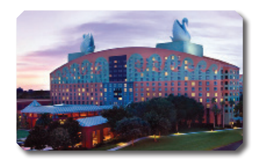
2020 July 6–9 Orlando, Florida Walt Disney World Swan Hotel

Details as they are available at: www.sofe.org