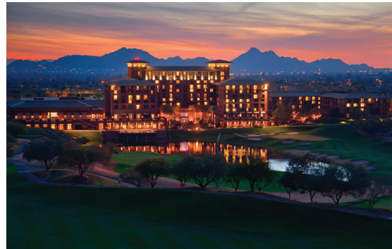
2021 July 18–21 Scottsdale, AZ Westin Kierland