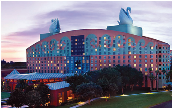
2020 July 19–22 Orlando, Florida Walt Disney World Swan Hotel