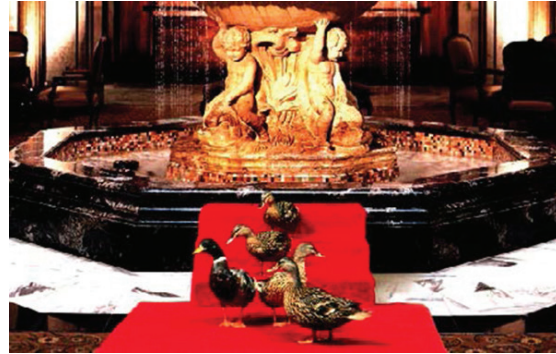
2019 July 21–24 Memphis, Tennessee The Peabody Memphis