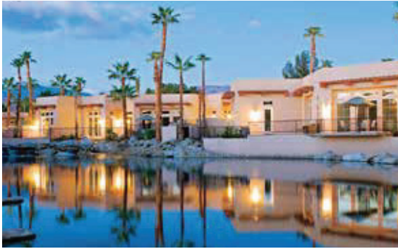
2018 July 15–18 Indian Wells, California Hyatt Regency Indian Wells

Details as they are available at: www.sofe.org