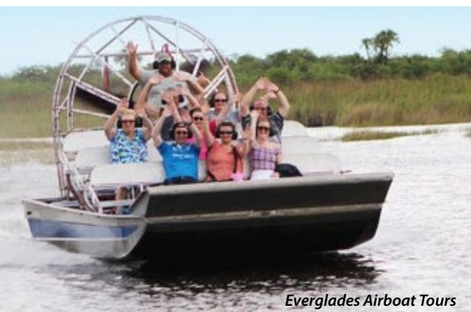
Everglades Airboat Tours

Mark your calendar now for Sunday, July 23 - Wednesday July 26.