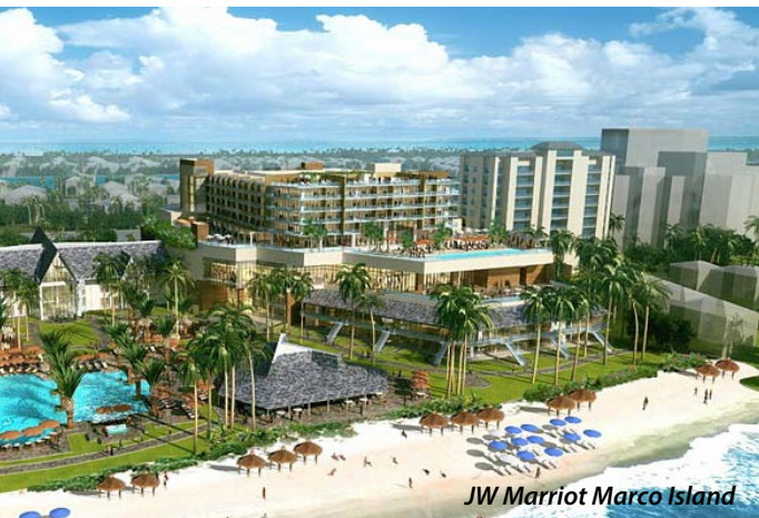
JW Marriot Marco Island

SOFE's Next Career Development Seminar will take place at the JW Marriott Marco Island in Marco Island, FL July 23-26, 2017 (Sun.-Wed.). Marco Island is the largest of Florida's Ten Thousand Islands, located on the Gulf of Mexico in Southwest Florida. Enjoy the tropical weather along with sunshine, pristine water and plenty of beach and water activities. Go "shelling" and see what shells you can find among uninhabited barrier islands blanketed with more than 400 types of seashells and other island keepsakes. With more than 80 beachside restaurants to choose from and plenty of boutiques and shops, there are endless options for food and shopping. The Florida Everglades and Naples are a short drive away. Further news on the 2017 CDS will appear in the February issue of Insight and at www.sofe.org .