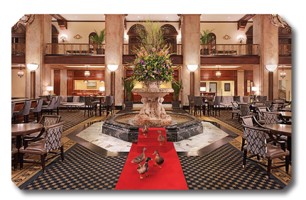
2019 July 21–24 Memphis, Tennessee The Peabody Memphis

Details as they are available at: www.sofe.org