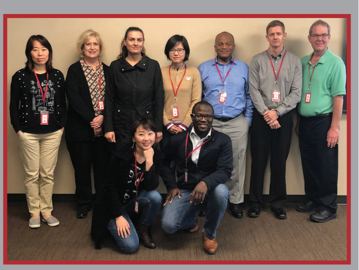
Attendees at the 2018 TN SOFE State Chapter Training in Nashville, TN