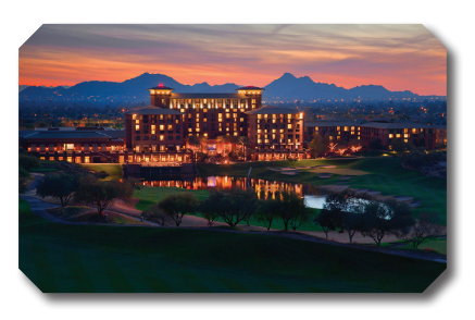
2021 July 18–21 Scottsdale, AZ Westin Kierland