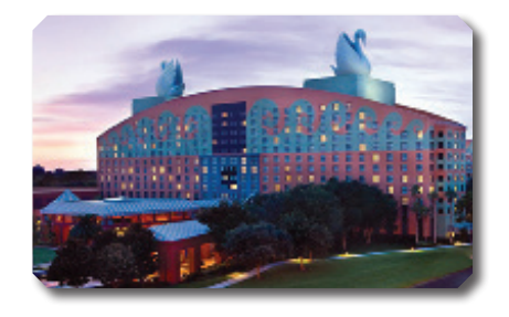
2020 July 19 – 22 Orlando, Florida Walt Disney World Swan Hotel