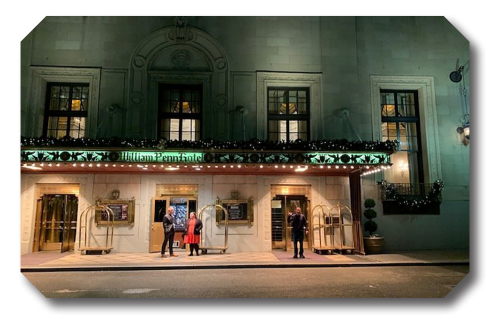
2022 July 24–27