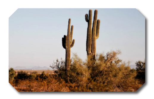
2021 July 19–22

Details as they are available at: www.sofe.org